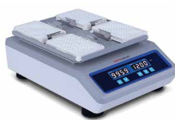
Digital Microplate Shaker shown with Thermo Scientific Clamp for 96-well Microplates.

Includes standard platform with 6 clamps (88882115) installed; holds 4 microplates. Warranty: 2 years | Certifications: cCSAus, CE