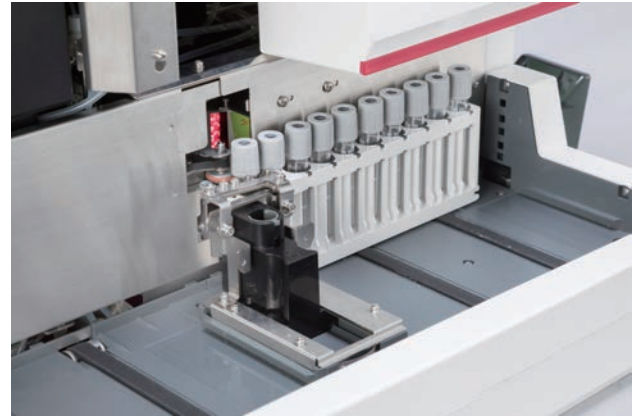
Identified as a set

Hemolysis sample or small sample volume can be measured in a sample cup. Pair rack can have a barcode labeled-sample tube and a sample cup identified as a pair, contributing to safety aspects by preventing mix-up and streamlined work flow.